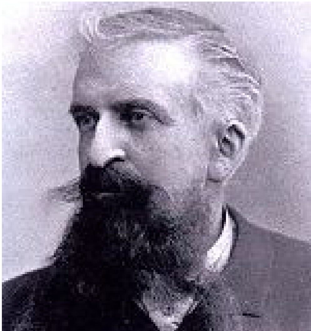
Gustave Le Bon