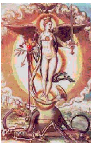
"The world system we inhabit came about by a mistake" (NHC II, 3:75.5).

The sacred creation story of the Mysteries (Sophia Mythos) explains that the archons arise due to an anomaly in the cosmic order.