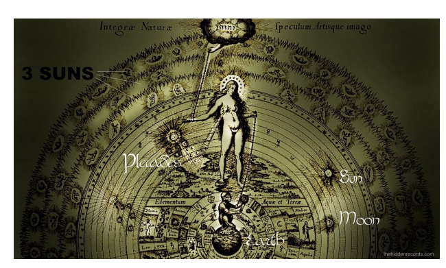
Sophia is the Anima Mundi, or " the soul of the world."

Sophia is the name Gnostics gave to the animating intelligence of the earth before it become this planet. In their view, the cosmic origin of our planet is present to us here and now as wisdom, the living, all-informing intelligence of nature.