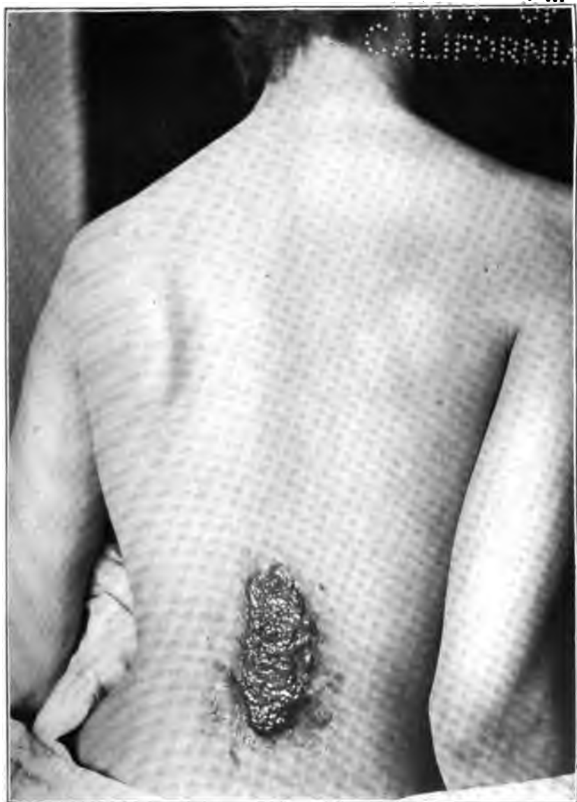
"ULCER" TAKEN FROM KIDNEY.