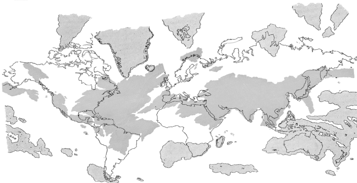
I. The World as it was 800,000 years ago Red—Atlantean Continent Grey—Lemurian Continent.