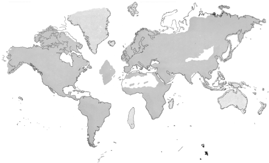
11 The World as it was 11,500 years ago. Red—Atlantean World. Grey—Remains of Lemurian World.