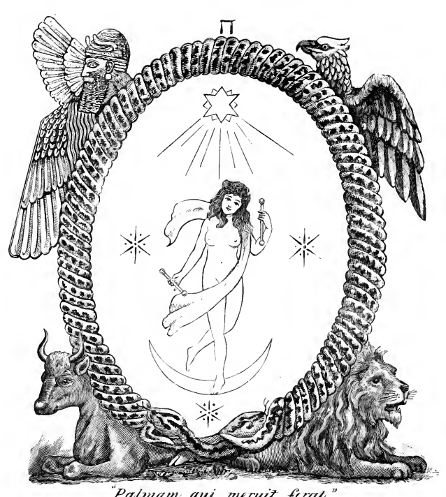
"Palmam qui meruit ferat."