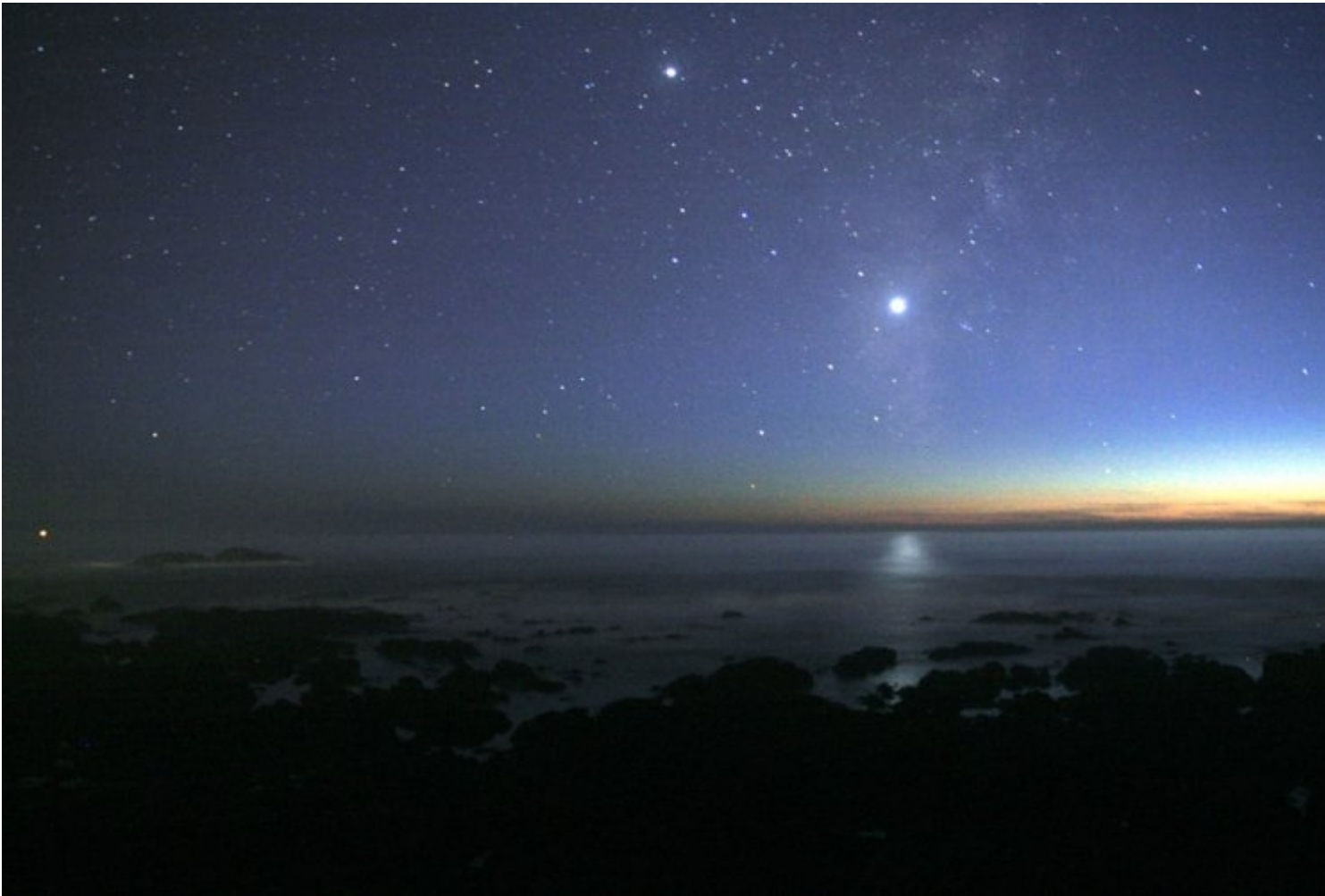
Venus on the horizon.

clockwise to the left. The LHP is the path of Venus, Sanat Kumara. The pentagram is also the symbol of Venus the shape of the orbit of Venus and the five is a Venus number. This symbol of Venus would have 666 placed with it to show spiritual rebirth. Venus's number also connect to the sun. The ankh the symbol of spiritual rebirth is the symbol of Venus.