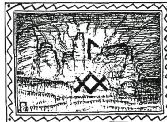
Fig. 1: Oldest Nordic rune of the "world sun" with the "Lögr" sign above it, which can be verified even before the flood. It can be found at the Externsteine. Her Nordic name is Ink, Ingo, Ank. She later appears in the East as the sign "Enochs". According to the Bible, Enoch lived before the flood (Genesis 5:18) and was the founder of heavenly knowledge. The upper rune means as "Lögr" the primordial water and at the same time as "Log" (demonstrable in the case of the Frisians) the primal law or the logos that broods in or over the waters!

There, where today near Detmold the Externsteine as the oldest symbol of the German spirit, providence has dug a rune into the heart of Germany as a legacy of dreamlike Childhood represents the symbol of a high future destiny—the Sun Rune : *)