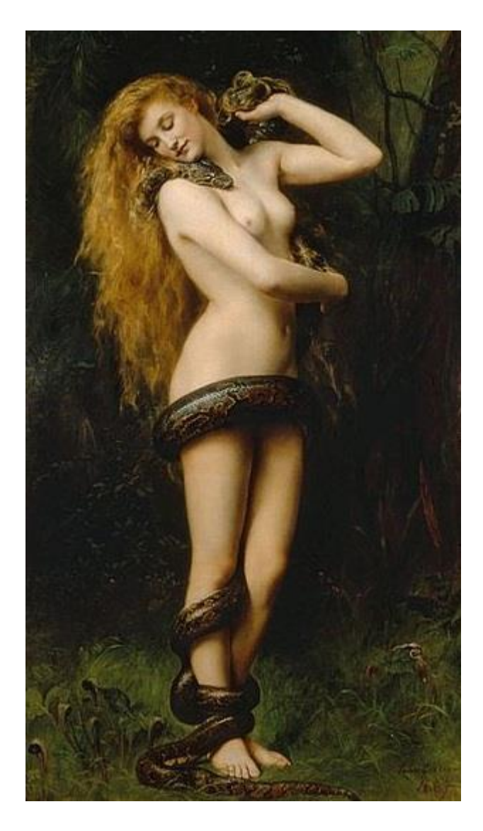
HAIL LILITH!!! http://www.joyofsatan.org