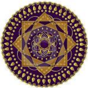
Hindu Mandala depicting the 8 pointed Star of Goddess Lakshmi