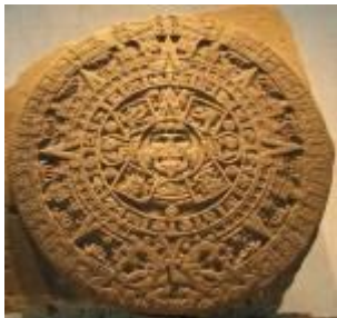
Ancient Aztec Calendar-note the 8 rays

The 8 pointed star is a Pagan Symbol that was associated with great power throughout the Ancient World. It was the symbol of the Goddess Inanna/Astaroth and also the symbol of Venus. It represents the Heart Chakra, the powerhouse of the Soul, in its empowered state when it radiates eight rays, connecting all 13 Major Chakras of the Soul.