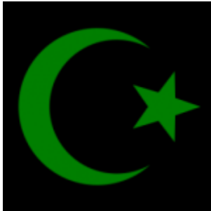
Primary symbol of Islam