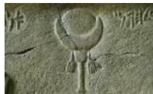
Ancient Assyrian Crescent of Baal