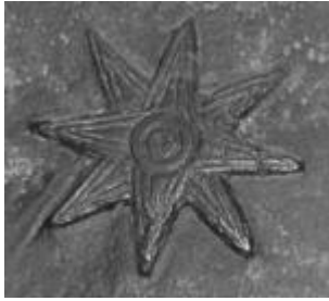
Ancient Sumerian Star of Ancient Goddess Ishtar