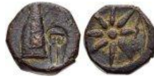
Ancient Greek Coin depicting the 8 pointed Star