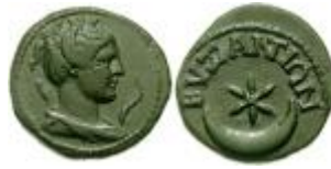
Ancient Pagan Byzantium coin