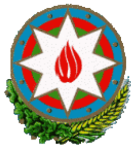
Flag of Azerbaijan