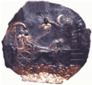
Ancient Babylonian Depiction

It is obvious that this symbol did NOT originate with islam. The Symbol of the Crescent Moon and Star is extremely Ancient and was present in every Ancient Pagan Culture of the world. It is a very powerful and important Alchemical Symbol, relating to the Third Eye and Sixth Chakra as well as to the Feminine Aspect of the Soul.