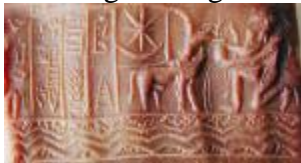
Ancient Sumerian Crescent And star