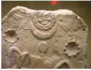
Ancient Hittite Crescent Moon/Sun