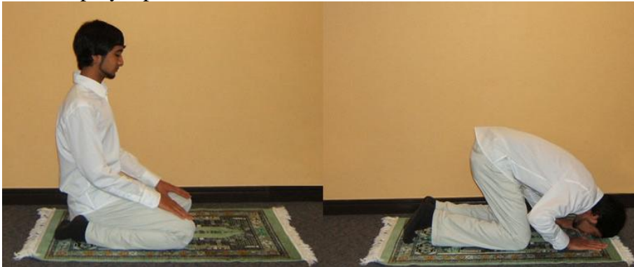
Matches with Vajrasana