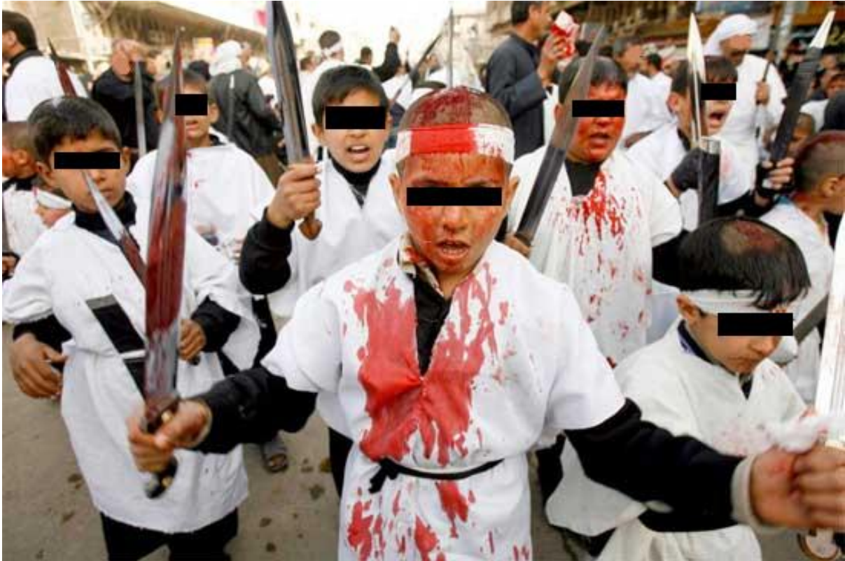
Iraqi children in the “celebration” of self-scourge known as “Ashura”.