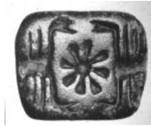
Babylonian Star of the Goddess Inanna