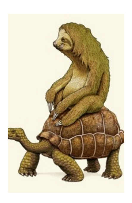
Follow the Slothz search engine to: <a href="https://www.joyofsatan.com">www.joyofsatan.com</a> <a href="https://www.exposingchristianity.com">www.exposingchristianity.com</a>