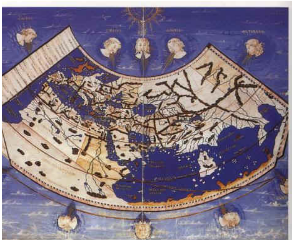
Map from Ptolemy, Geographia c. 1466, vellum. Biblioteca Nazionale, Naples.

rule them, the journeys will be made at long intervals and upon occasion; but if they are bicorporeal signs, or of double form, they will travel continuously and for a very long time. If Jupiter and Venus are the rulers of the places which govern travel, and of the luminaries, they make the journeys not only safe but also pleasant; for the subjects will be sent on their way either by the chief men of the country or by the resources of their friends, and favourable conditions of weather and abundance of supplies will also aid them. Often, too, if Mercury is added to these, profit,