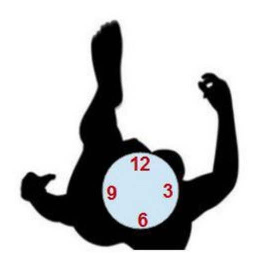
Figure 3. How does it track someone walking around? (This technology is described in general terms here, as the specific capabilities and limits of the tracking satellites are not known) Your skull bone makes an excellent reflector of a microwave beam. The reflected signal can be tracked by using a pattern of the top of your head. The tracking signal frequency at 3640 MHz, bounces a signal off the person's head in 4 or more locations – we

Figure 2. Microwave Targeting. A grid pattern of microwave shots or "bullets" is used and the reflected signal tells them exactly where you are and how you are positioned. Your body is mostly water – and this has a unique reflected signal. Your brain will emit a unique frequency that identifies you among a crowd of people that are being hit with microwaves. This grid scan can be done in a matter of seconds using the satellite, and is particularly easy if the target is still or sleeping. It even works thru many stories in an apartment building – because the reflected signal is very unique when it hits a person. If a mylar sheet is placed above the person, you can actually hear the microwave shots hitting the mylar sheet. (a microphone recording can be made this way with the sound amplified.) The satellite's tracking signal can shoot more than 20 times per second – and the frequency is about 3600 to 3750 MHz. They can track many people at the same time with one satellite. No tracking chip implant is needed.