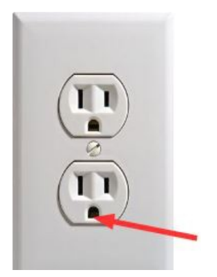
Figure 1. Ground a wire to the bottom hole in a 3-prong outlet. Use some tape to hold it in place. One method is to stick the loose end under the elastic in your underwear, or connect the ground to a piece of aluminum foil that is touching your bare skin.