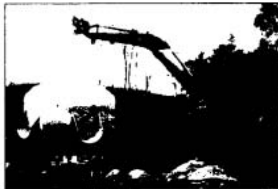
An ES10 shelter about to be lowered into the ground.