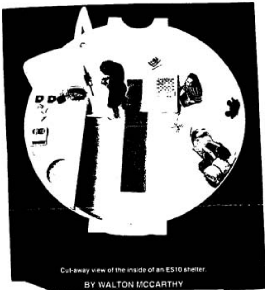
Cut-away view of the inside of an ES10 shelter.