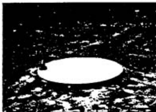
The entrance way hatch at ground level has no projections and lies flush with the ground surface.