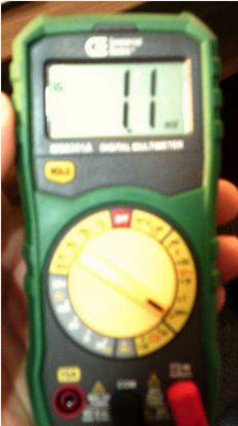
Figure 6. Typical voltmeter reading on an aluminum strip over the top of the head, 1.1 millivolts. The voltmeter was tested against the output of a new 6 volt battery, which correctly showed slightly higher than 6 volts, confirming that the voltmeter was reading accurately.