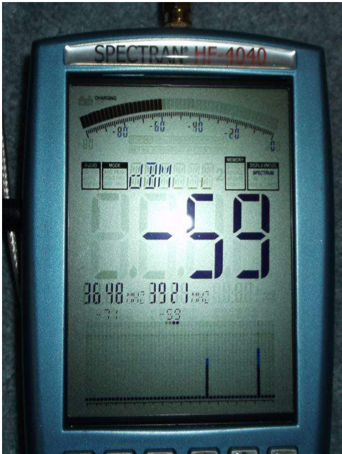
Figure 1. Typical Spectran HF-4040 reading taken in summer 2016. 3648 MHz at -71dbm and 3921 MHz at -59 dbm. There are very few users in this frequency range – so it is easy to identify. Scans were typically done by sweeping between 3500 MHz and 4000 MHz, but could be narrower, once the range is known.