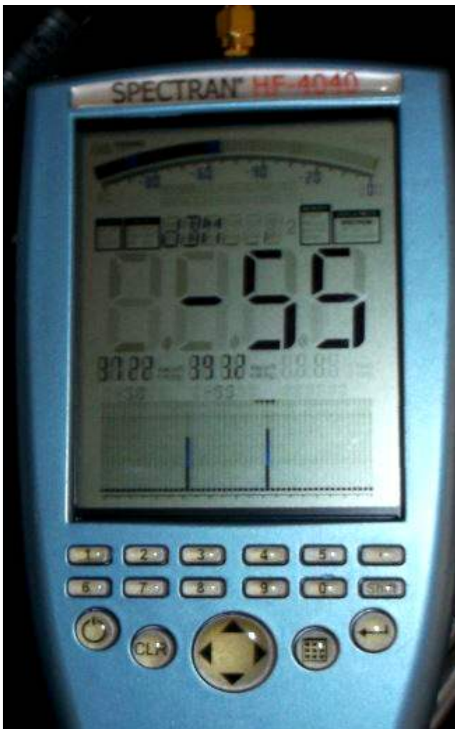
Figure 3. Another typical Spectran HF-4040 reading. 3722 MHz at -58dbm and 3932 MHz at -55dbm.

The FCC frequency table was obtained from: transition.fcc.gov/oet/spectrum/table/fcctable.pdf