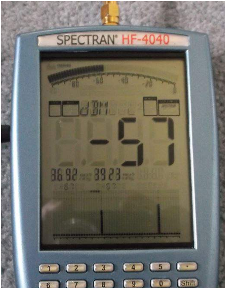
Figure 2. Another typical Spectran HF-4040 reading, 3692 MHz at -67dbm and 3923 MHz at -57 dbm.