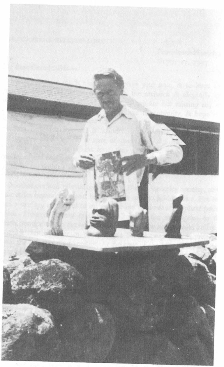
Clark Ashton Smith with some of his sculptures

the fifth book of which opens with a very pretty description of the Newport countryside, & of the fox-hunting of the local 'squires. The whole scene here is exquisitely delightful—blue of sea & sky, white of gleaming beach & fleecy cloud, grey of noble crag & ledge, & deep, restful green of kine-dotted pasture & hillock. Over all, on the inland side, towers the grey Gothick church of St. George's School; giving in that setting a perfect & poignantly lovely facsimile of a gentle English landscape, with hedge, croft, & distant abbey. One cannot resist the inclination to burst into numbers at such a sight: