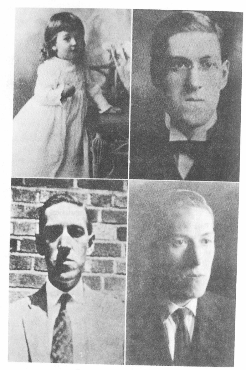
Four views of H. P. Lovecraft