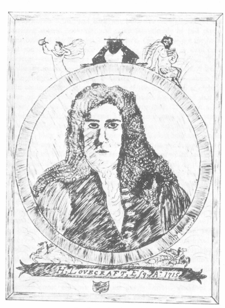
A self-portrait of Lovecraft