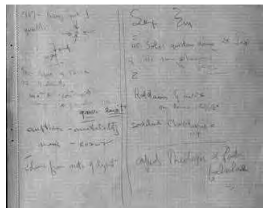
Plate 2 Pound's Eriugena notes: YCAL MSS 43, Box 77, Folder 3406, l.25.