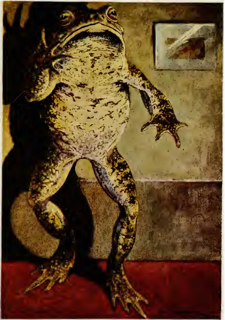
Dwelling chiefly on his own cleverness, and presence of mind in emergencies