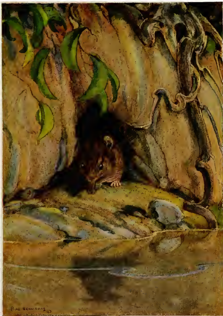
It was the Water Rat