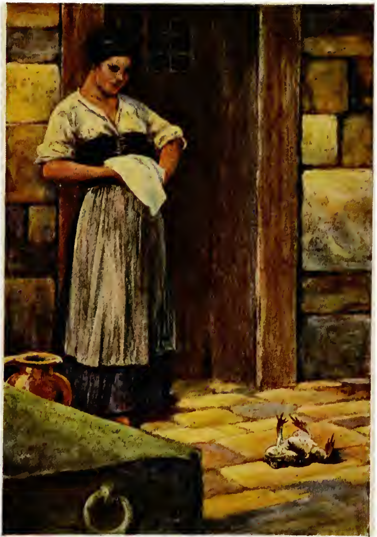
He lay prostrate in his misery on the floor