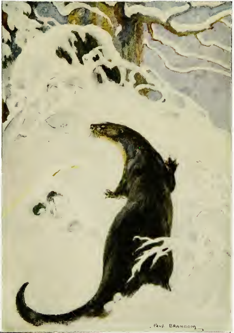
Through the Wild Wood and the snow