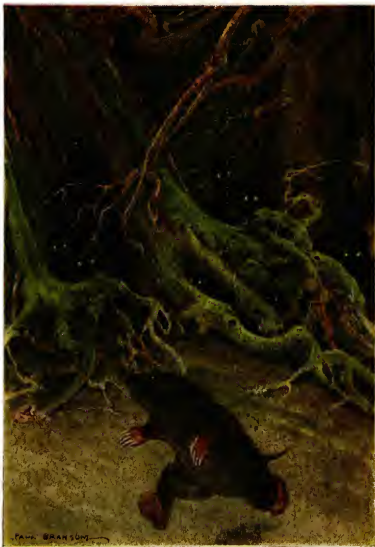
In panic, he began to run