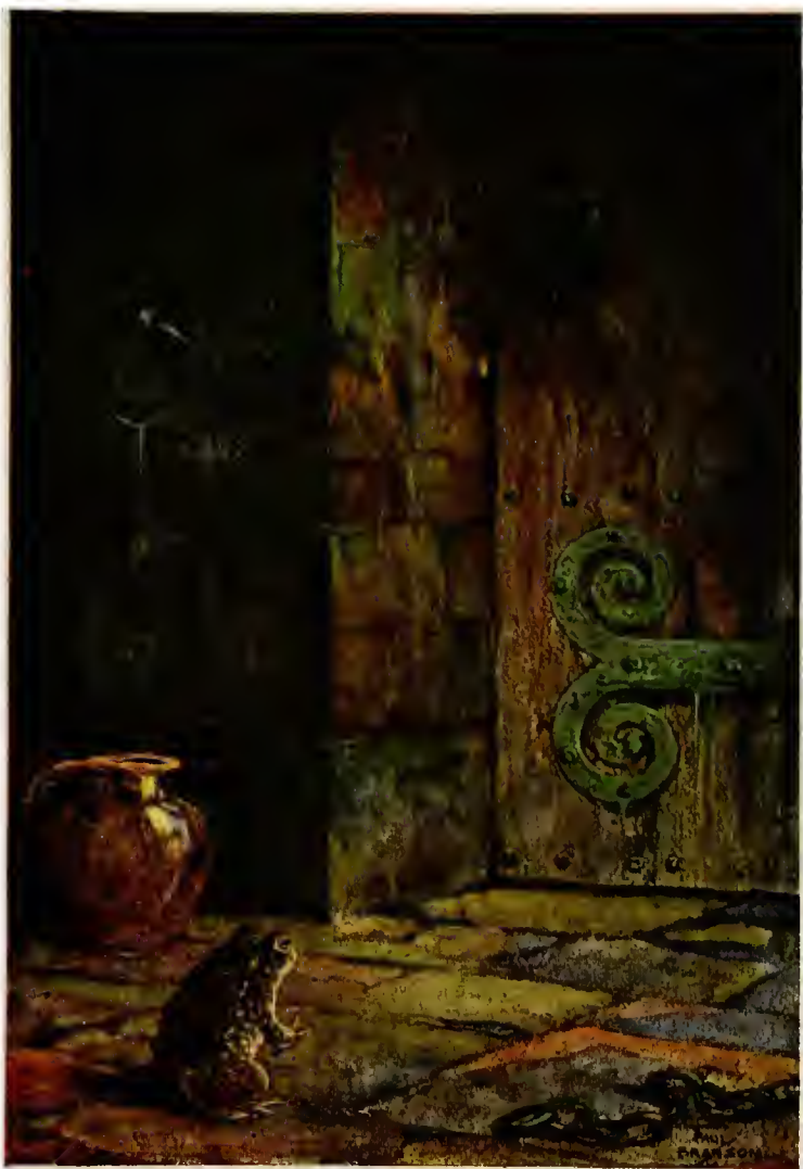
Toad was a helpless prisoner in the remotest dungeon