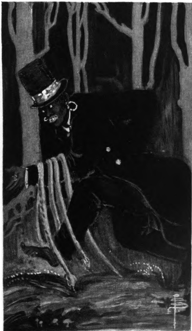
"Oolanga's black face . . . peering out from a clump of evergreens."