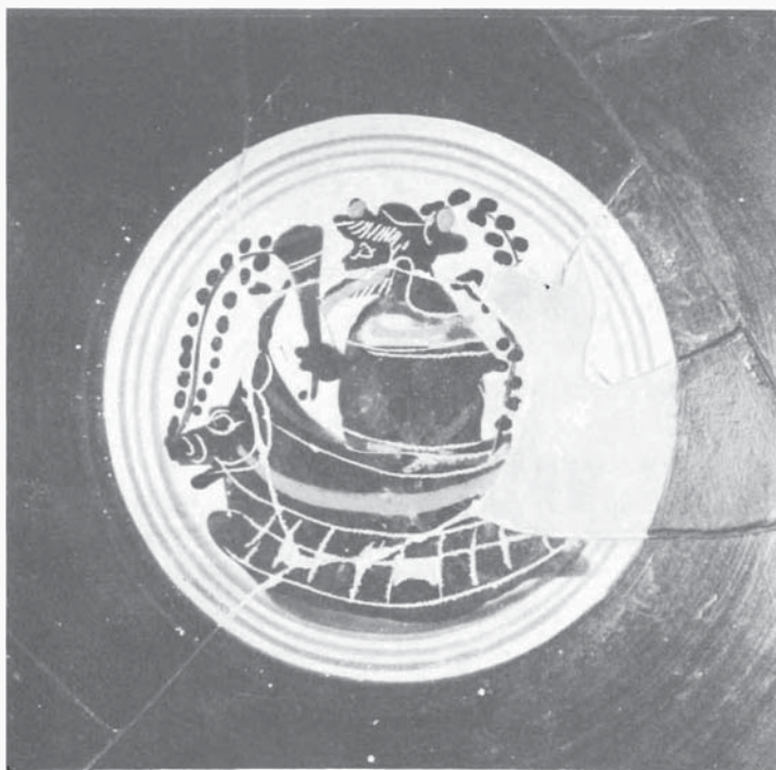
PLATE 11 Dionysus sailing in a ship with the bow shaped like an ass's head. Detail from a cup (Beazley, ABFVP , p. 369, no. 100). From the collection of the Staatliche Museen, Berlin, Antikenteilung. (Acc. No. 2961)