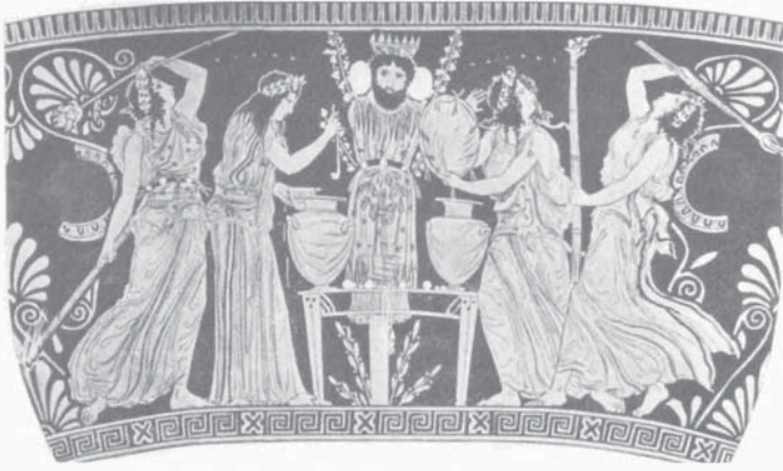
PLATE 2 Maenads ladling out wine before a robed, masked Dionysus column. Redrawn from stamnos painted by the Dinos painter (Frickenhaus, Lenäenvasen , Pl. 29A; P.E. Arias, A History of 1000 Years of Greek Vase Painting , pp. 372-375, Pl. 206; Beazley, ARFVP 2 , p. 1151, no. 2 [2]). From the collection of the Museo Nazionale Archeologico, Naples. (Acc. No. 2419)