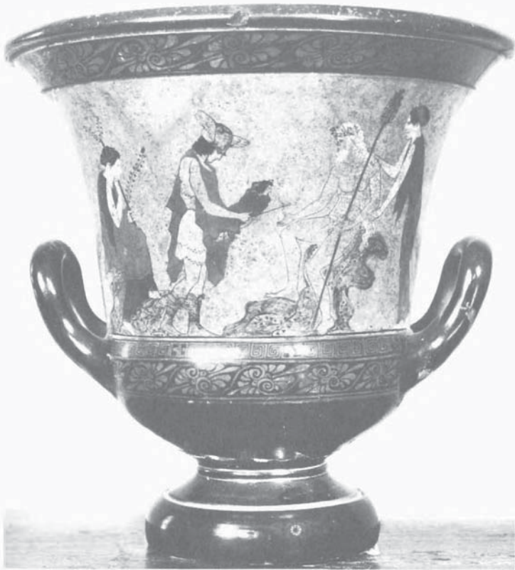
PLATE 7 Hermes bringing the new-born Dionysus to the nymphs and Papposilenus at Nysa. White-ground calyx-krater painted by the Phiale painter (Arias, A History of 1000 Years of Greek Vase Painting , p. 367, Pl. XLIV; Beazley, ARFVP 2 , p. 1017, no. 54). From the collection of the Museo Gregoriano Etrusco, Vatican Museum. (Acc. No. 559)