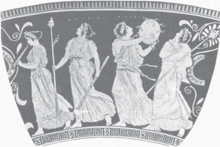
PLATE 3 Maenads dancing at the festival of Dionysus. Another view of stamnos cited above (Frickenhaus, Pl. 29B).