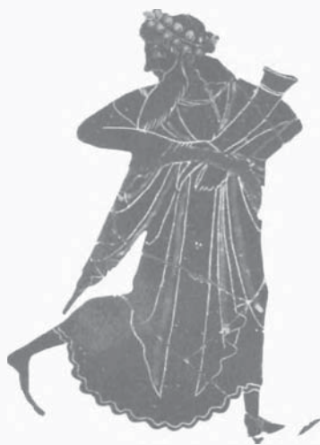
Dionysus. Detail from a wine cup attributed to Pheidippos (ca. 520-510 B.C.). The Metropolitan Museum of Art, Rogers Fund, 1941. (Acc. No. 41.162.8)