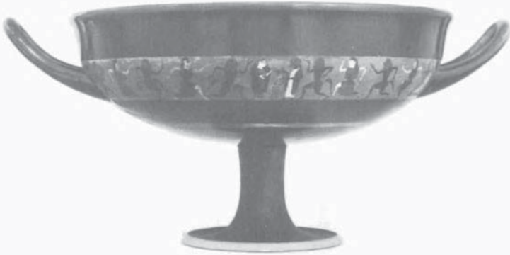
PLATE 12 Dionysus and Ariadne accompanied by satyrs and maenads (VI Century B.C.). A little master band-cup (Beazley, The Development of Attic Black Figure , p. 56 and Pl. 24 and 25). From the collection of The Metropolitan Museum of Art, Rogers Fund, 1917. (Acc. No. 17.230.5) Detail of decorative band shown below.