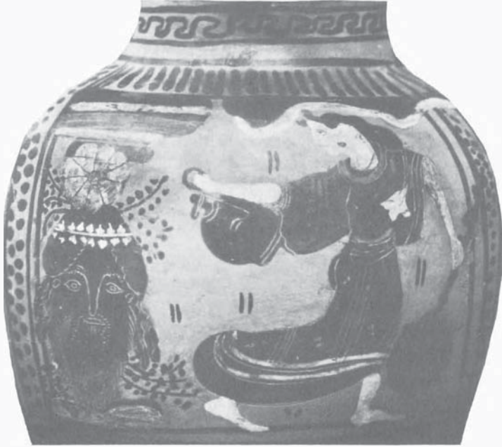
PLATE 5 Detail from vase showing maenad dancing in a grotto before a large, bearded Dionysus mask. Oinochoe (Frickenhaus, Lenäenvasen , Pl. 1; Beazley, ABFVP , p. 573, no. 2). From the collection of the Staatliche Museen, Berlin, Hauptverwaltung. (Acc. No. 1930)