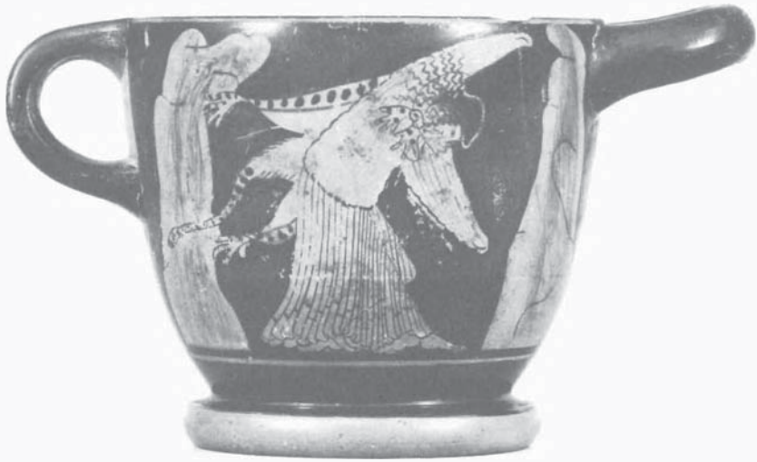
PLATE 9 A maenad dancing. Skyphos (ca. 490-480 B.C.) attributed to the Brygos painter (Beazley, ARFVP 2 , no. 176 [132]). From the collection of The Metropolitan Museum of Art, Fletcher Fund, 1929. (Acc. No. 29.131.4)