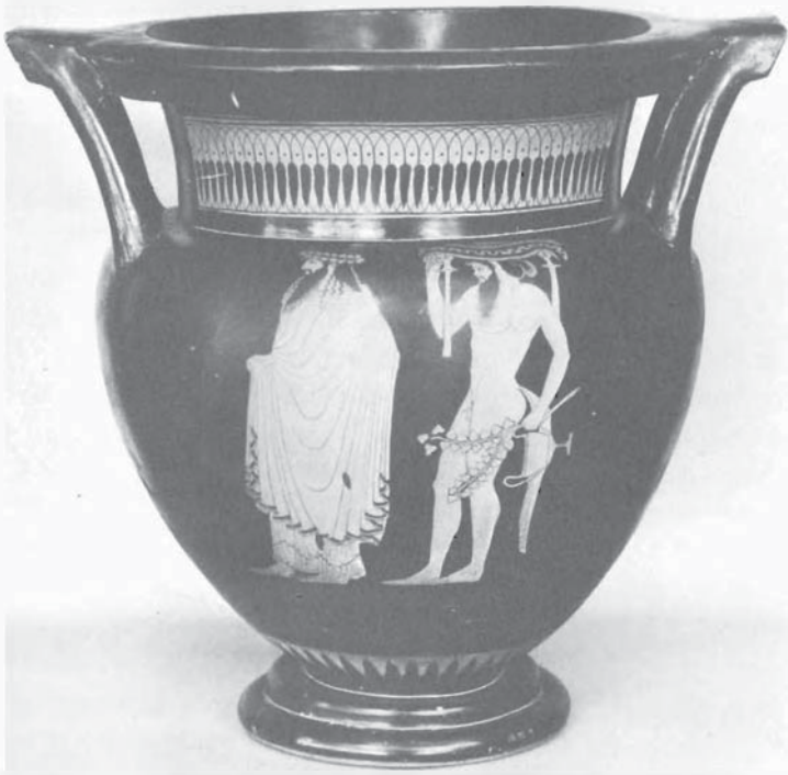
PLATE 13 Dionysus and a satyr. Column krater (ca. 470-460 B.C.) painted by the Pan painter (Beazley, ARFVP 2 , p. 551, no. 6 [8]). From the collection of The Metropolitan Museum of Art, Rogers Fund, 1916. (Acc. No. 16.72)