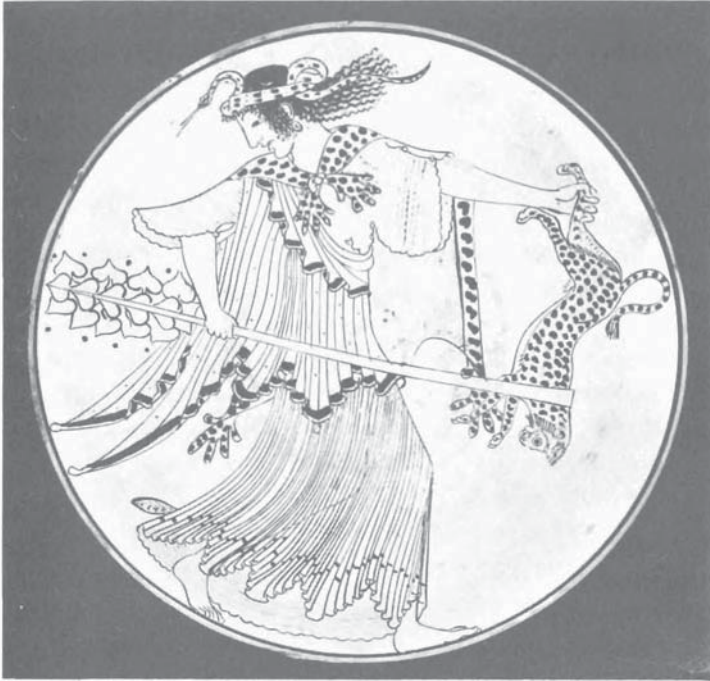
PLATE 6 Maenad carrying the thyrsus and brandishing a leopard cub. Detail from inside of a cup painted (ca. 490 B.C.) by the Brygos painter (Arias, A History of 1000 Years of Greek Vase Painting , pp. 337-338, Pl. xxxiv; Beazley, ARFVP 2 , p. 371, no. 15). From the collection of Staatliche Antikensammlungen, Munich. (Acc. No. 2645)