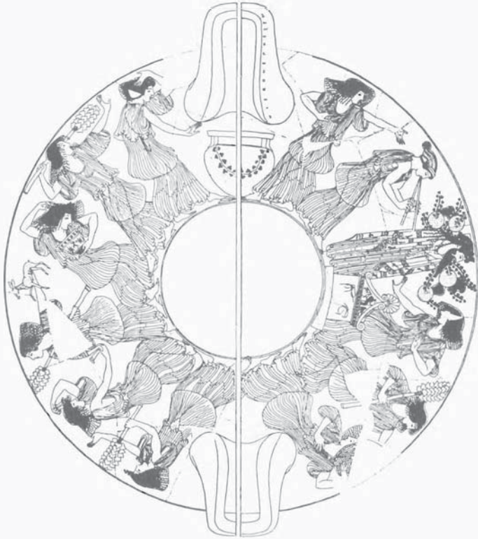
PLATE 1 Maenads in ecstasy dancing before a robed, masked Dionysus column. Redrawn from the cup painted by Makron (Frickenhaus, Lenäenvasen , Pl. 11A and 11B; Beazley, ARFVP 2 , p. 462, no. 48 [37]). From the collection of the Staatliche Museen, Berlin. (Acc. No. 2290)