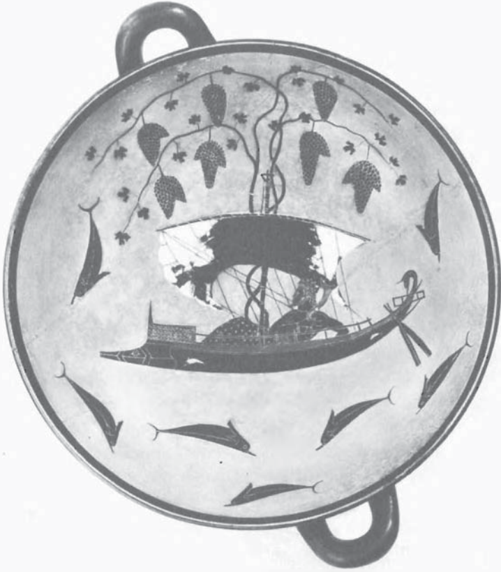
PLATE 10 Dionysus as seafarer. Inside of a cup painted by Exekias (Arias, A History of 1000 Years of Greek Vase Painting , pp. 301-302, Pl. xvi; Beazley, ABFVP , p. 146, no. 21). From the collection of the Staatliche Antikensammlungen, Munich. (Acc. No. 2044)