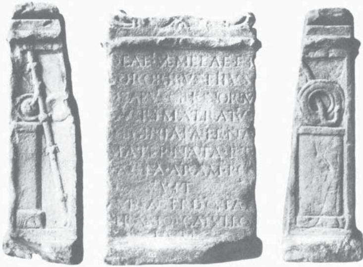
PLATE 4 An altar to Semele and her sisters in honor of their sacred motherhood, CIL 13.2.8244. The first four lines read as follows: DEAE SEMELAE ET/ SORORIBUS EIUS/ DEABUS OB HONOREM/ SACRI MATRATUS. Note the thyrsus, castanets, plakous (bread), and shepherd's crook. From the collection of The Museum of the City of Cologne.