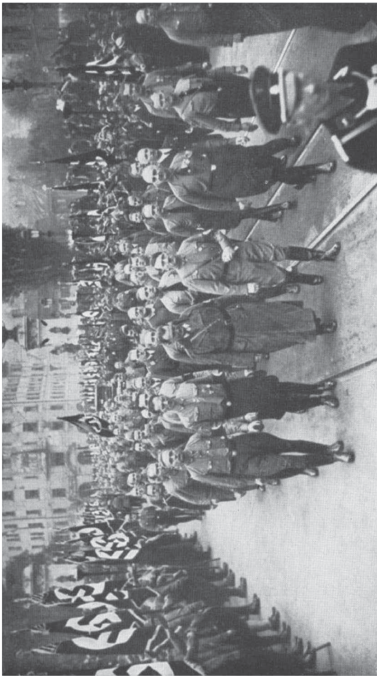
The Mtmch znr Feldherrnhalle e-ni i). November Behind dem A n h e r r in the second row A ! fred Rvsenberg