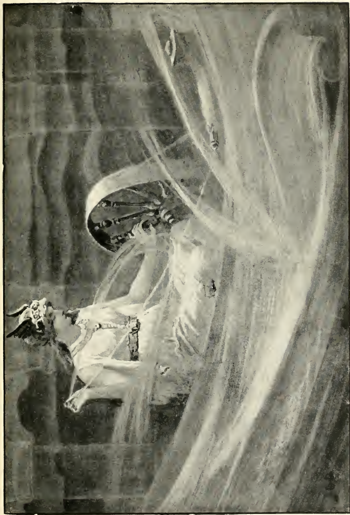
Frigga spinning the Clouds J. C. Dollman