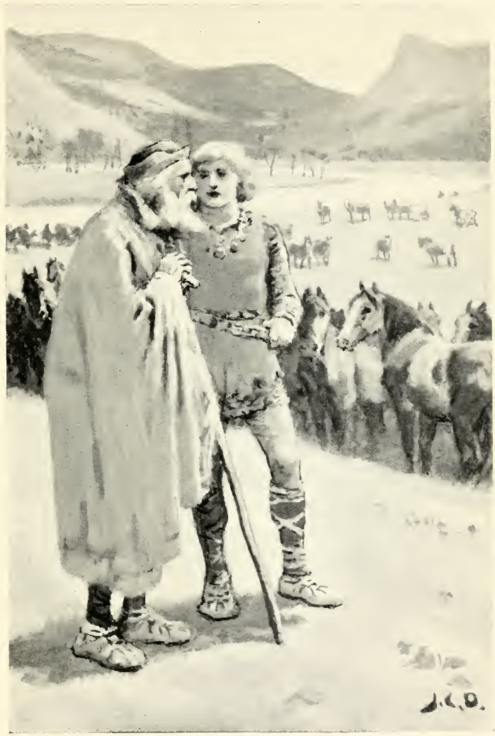
The Stranger advises Sigurd how to choose his Horse