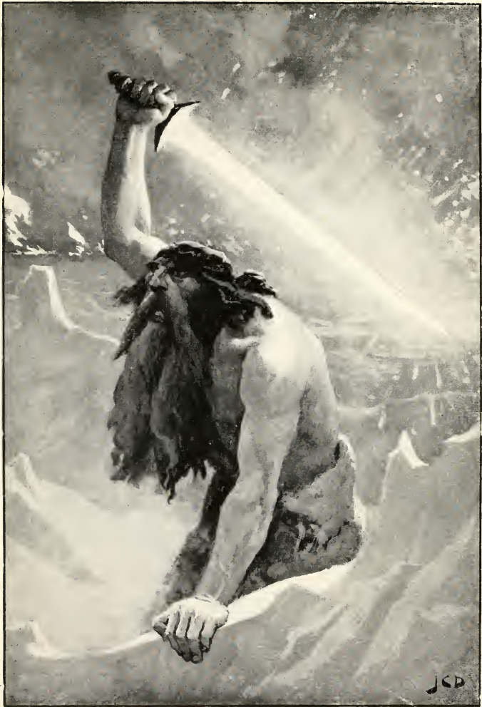
The Giant with the Flaming Sword J. C. Dollman