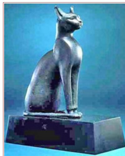
The Sacred Cat of Bast

Amazon cultures were known to be able to breed without the use of a male. Because the human body is primarily androgynous , a separation of the sexes is not theoretically necessary for procreation. This contention about the Amazons is backed up by the fact that the zona pellucida (the reproductive body in the female which contains a sack) can be