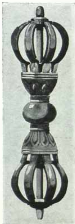
THE DORJE THE LĀMAIC SCEPTRE Described on page xxxiii