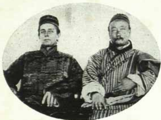
THE TRANSLATOR (right) AND THE EDITOR IN GANGTOK, SIKKIM