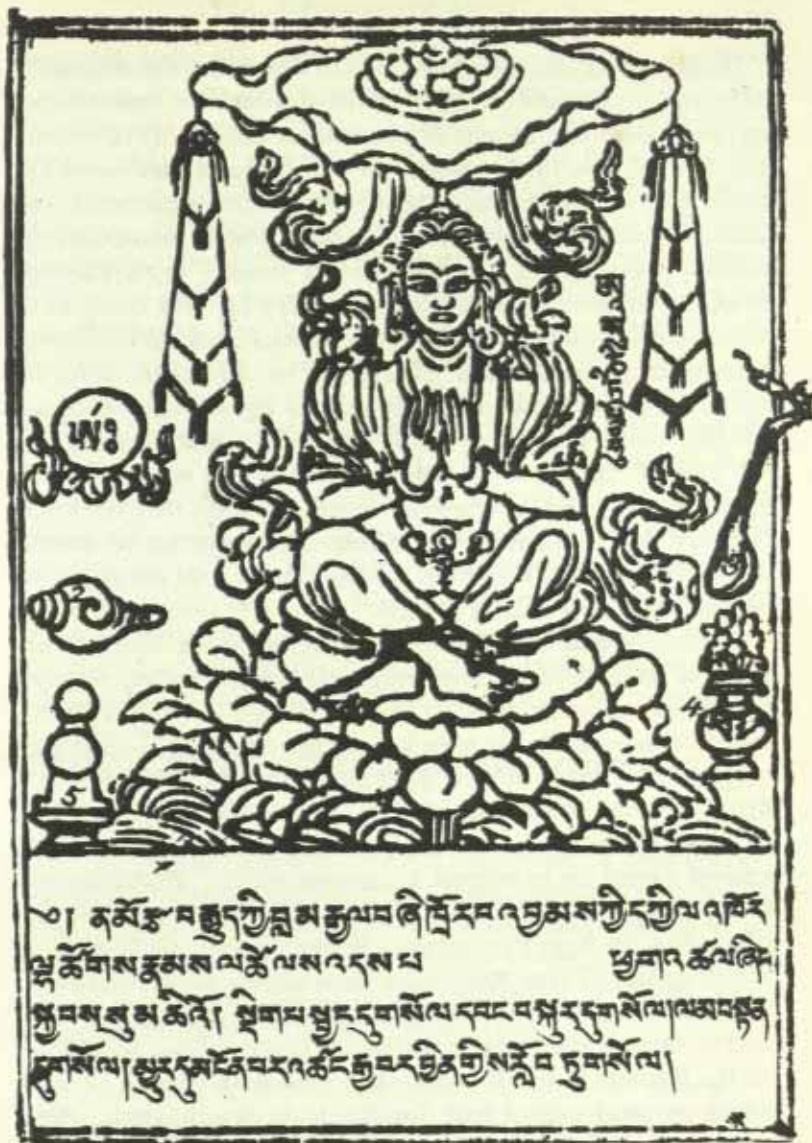
THE EFFIGY OF THE DEAD PERSON

(1. Mirror. 2. Conch. 3. Lyre. 4. Vase with flowers. 5. Holy Cake.)