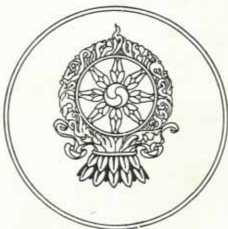
THE TIBETAN WHEEL OF THE LAW