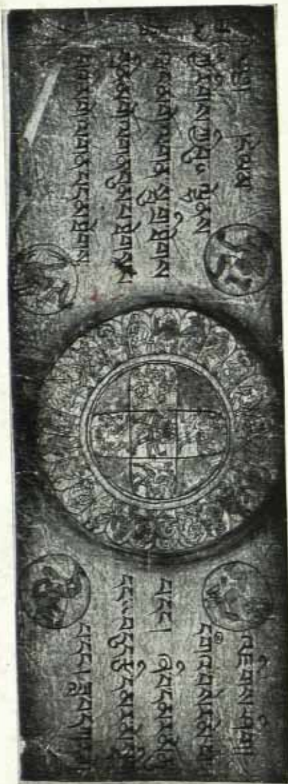
FOLIOS 35A AND 67A OF THE BARDO THÖDOL. MS.