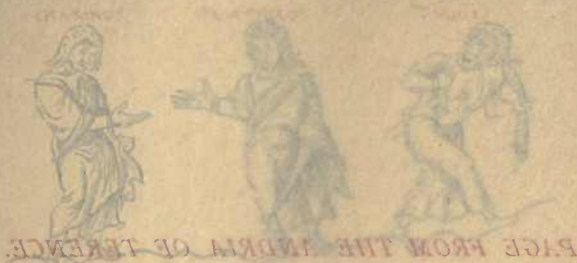
PAGE FROM THE ANDRIA OF TERENCE.

Fac-similes from Rare and Curious Manuscripts of the Middle Ages.