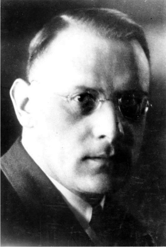
Hans F. K. Günther