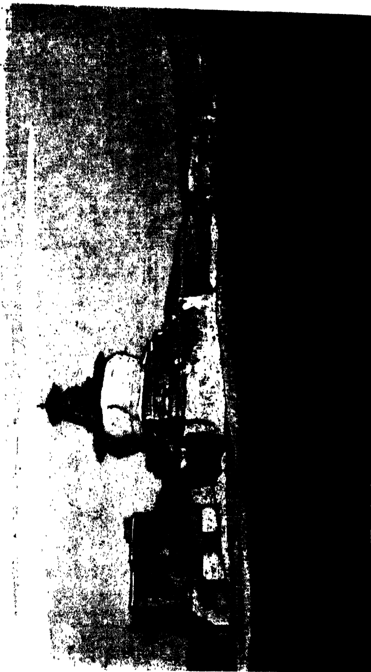
From a painting by Nicholas Roerich