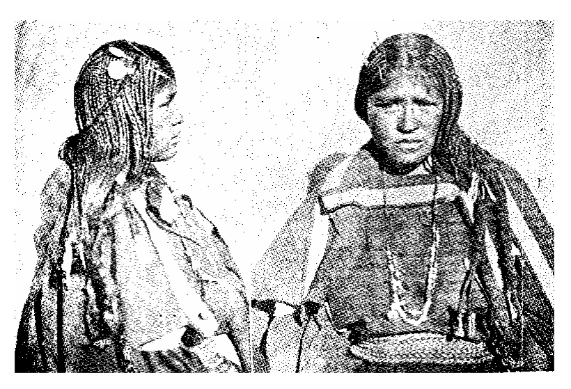
Fig. 4 Chipaya woman (Carangas, genuine "Aruwake" type) showing her special headdress with 36 braids held by special "moles". She also shows her typical dress (Urdu).