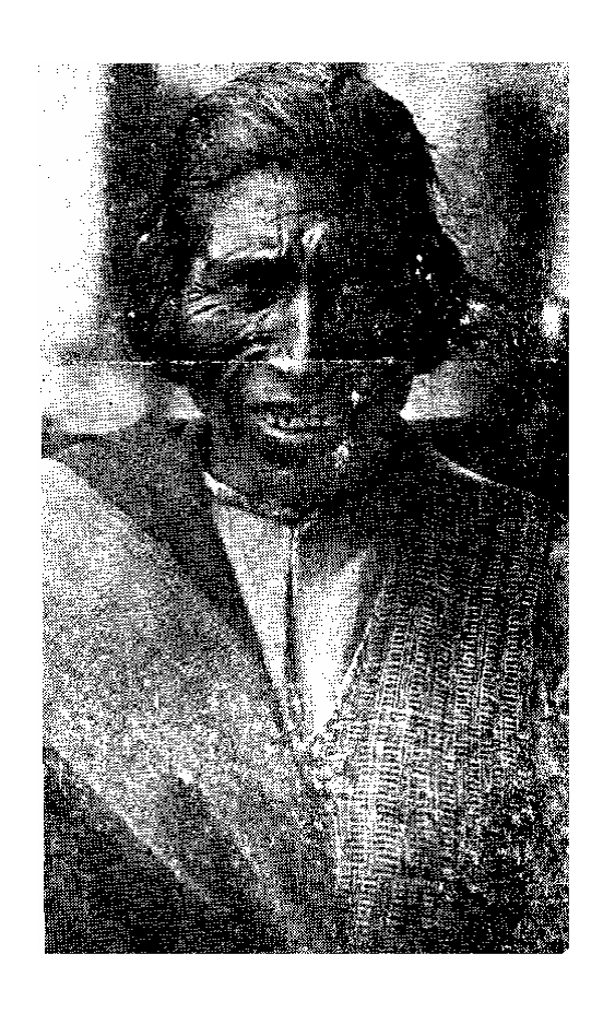
Fig. 6Kholla type from Rio Debajo de La Paz