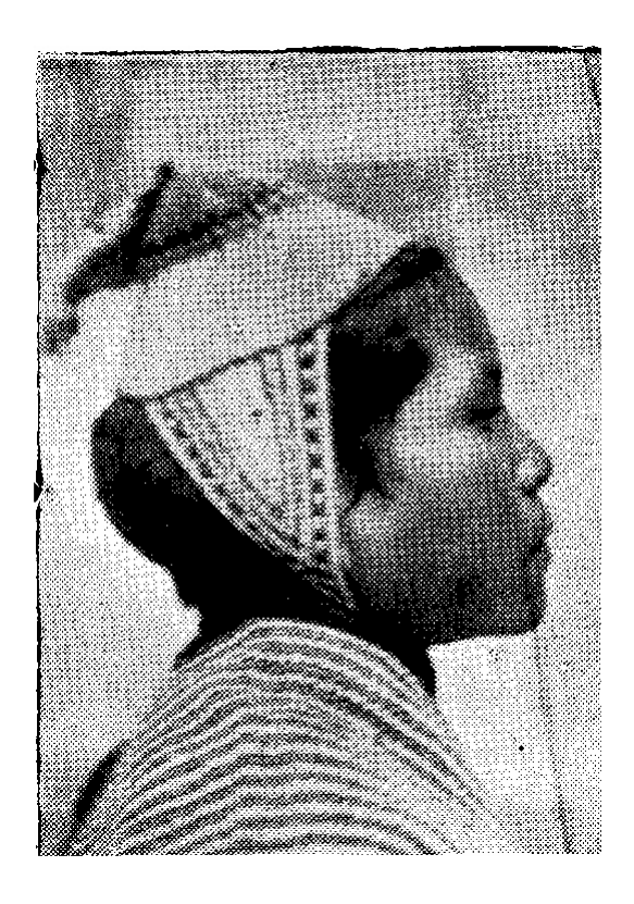
Ayoung man from Chipaya Loza from the middle Dolicephalus