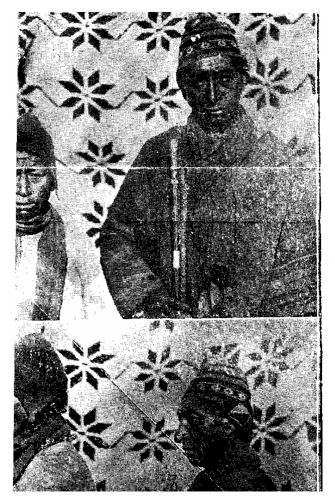
Fig. 5 Aruwake Chipaya type with Kholla type next to it Carangas - Bolivia.