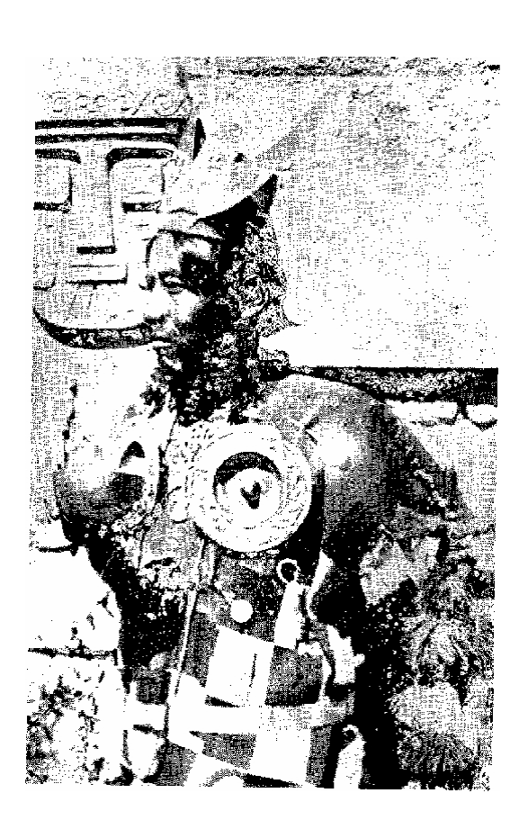
Fig. 7 Kholla type from Collana, Dep. de La Paz