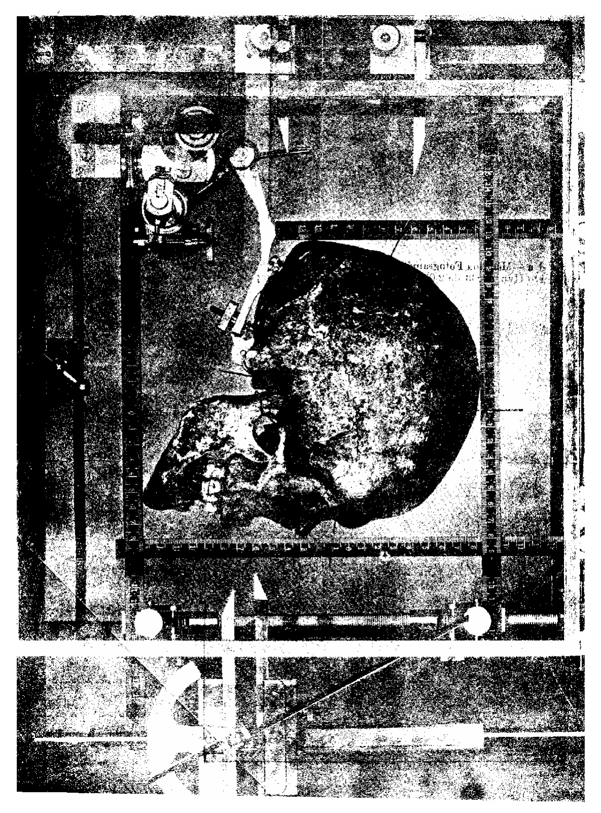
Fig. 1 Posnansky's "Cubuscraniophore" for craniometry and photogrammetry skull with which precision anthropological work is carried out at the "Tihuanacu" Institute of Anthropology, Ethnography and Prehistory.