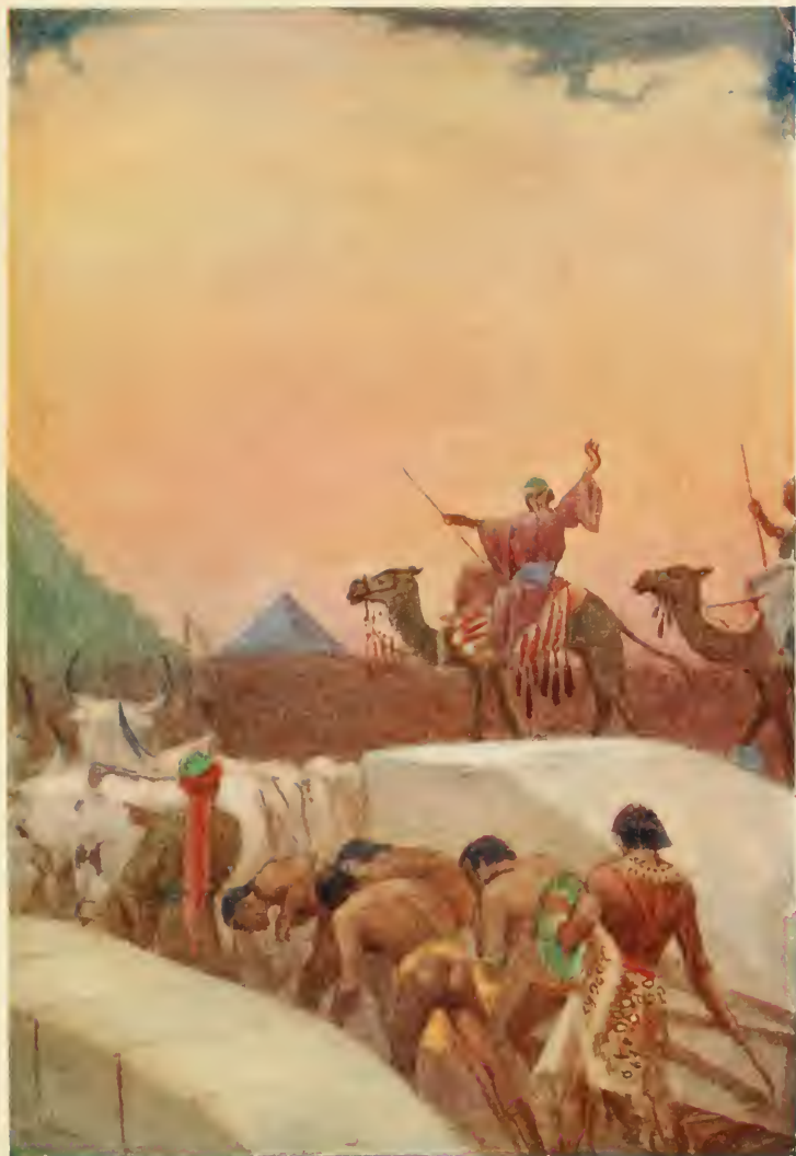
Hauling Blocks of Stone for the Pyramids