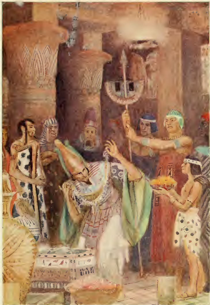
The Treasure-chamber of Rhapsinitus