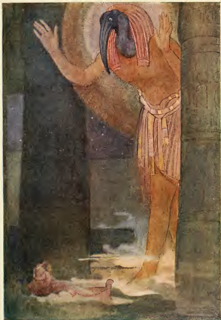
The God Thoth