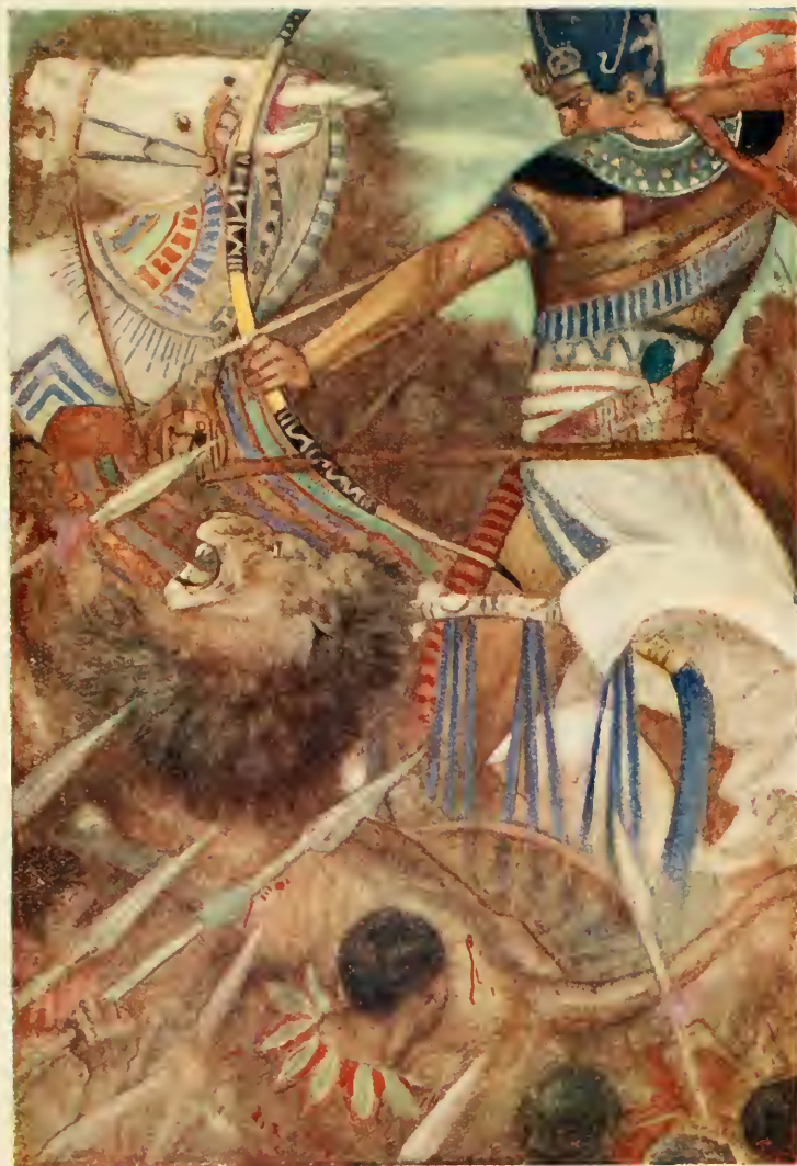
Rameses II defeating the Khetans