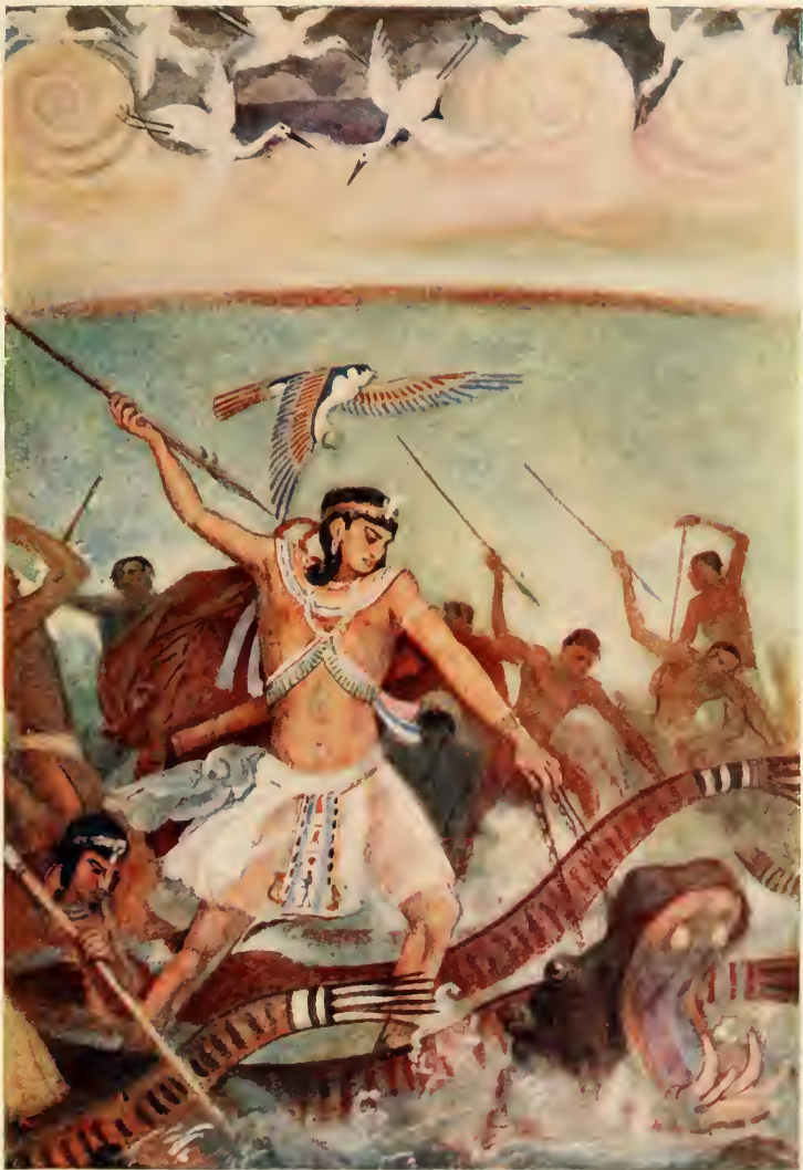
Horus in Battle