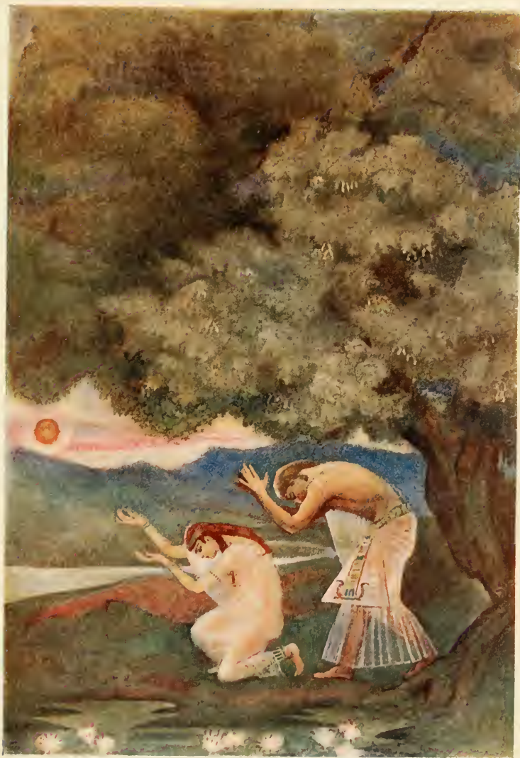
The Coming of Osiris and Isis